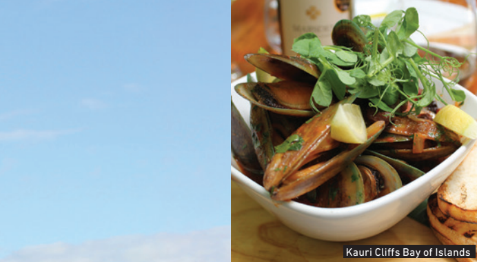
Kauri Cliffs Bay of Islands