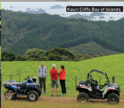
Kauri Cliffs Bay of Islands