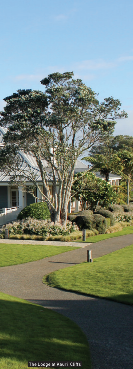
The Lodge at Kauri Cliffs