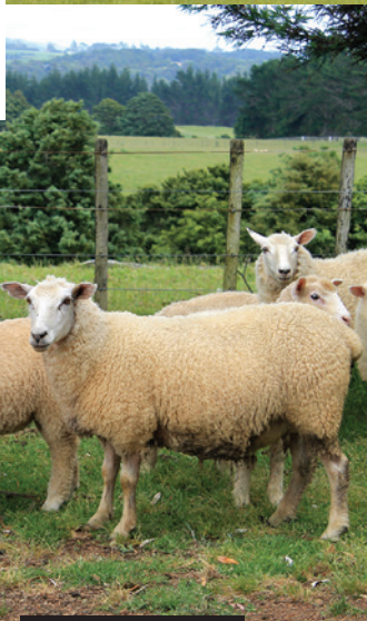
Kauri Cliffs Bay of Islands