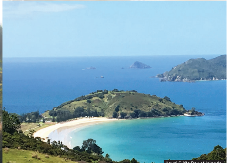
Kauri Cliffs Bay of Islands