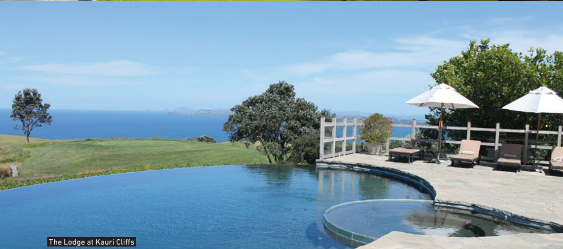
The Lodge at Kauri Cliffs

With their superb cuisine and an exceptional wine cellar, you'll find yourself looking forward to drinks and canapés each evening before dinner. Many guests follow similar itineraries and it's fun to see familiar faces as you compare travel stories.