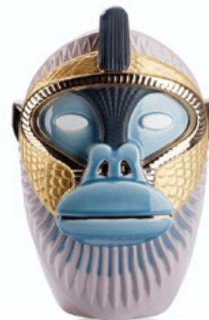
Primates by Elena Salmistraro