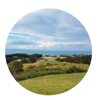
ABOVE AND BEYOND From top: Eight hundred feet above the ocean is a memorable spot for nuptials at The Farm at Cape Kidnappers; the front lawn at The Farm boasts expansive greenery and breathtaking views of the Pacific Ocean—the perfect place to say "I do!"